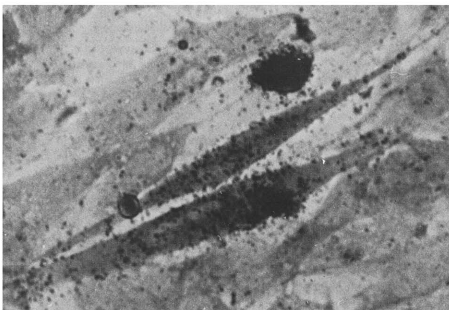
Fig.3. Autoradiography of ^{125}\text{I} -labeled \alpha -BNT-labeled muscle cells fused in the presence of actinomycin D ( \times 400 ).

fusion. This phenomenon raises the question whether the 2 events, cell fusion and the changes in the amounts of the above mentioned proteins, are causally or only temporarily related. Inhibition of fusion by lowering the \text{Ca}^{2+} concentration in the growth medium of rat cell cultures prevents the normal increase in the amount of these proteins. On the other hand, the levels of these proteins in chick muscle cells are hardly